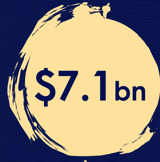
Financed since inception